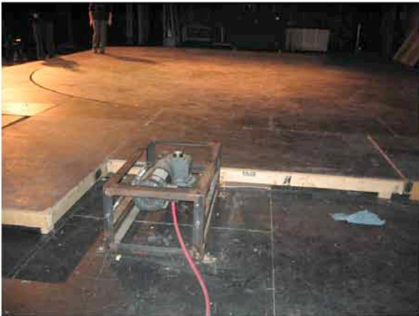
Motor & Deck Height