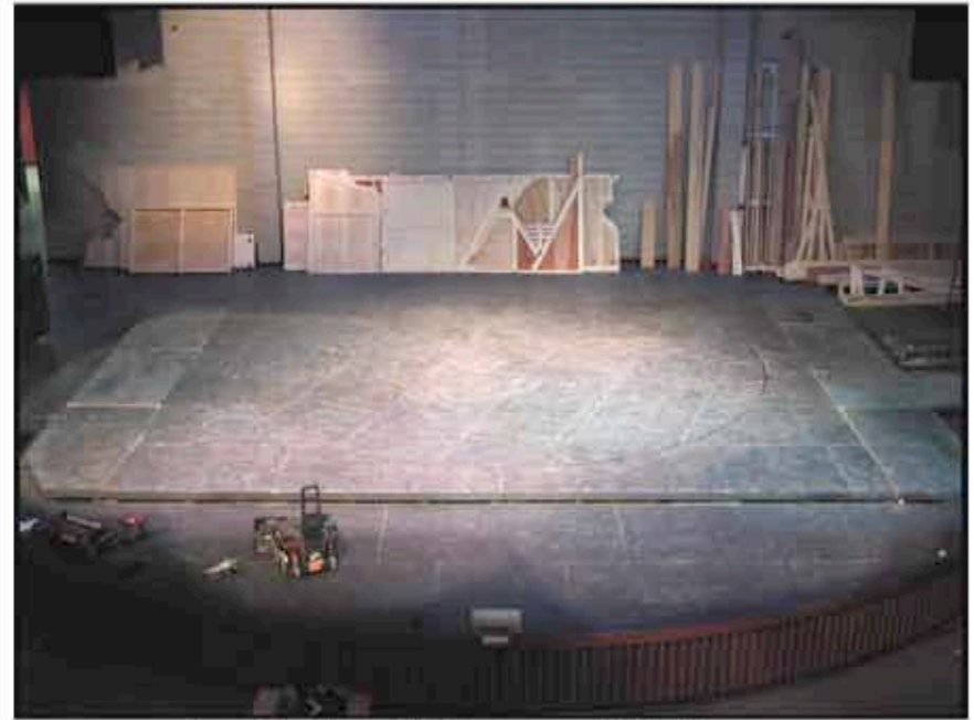
Turntable with Surround Platforms